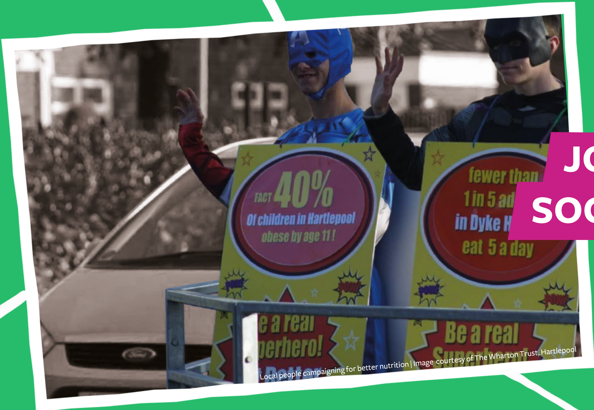
Local people campaigning for better nutrition